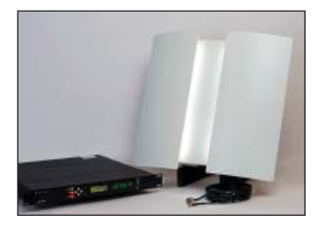
RG-58 cable, and SecureSync GPS time Server

Skylight includes indoor GPS antenna panel,